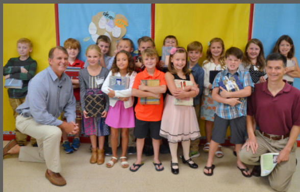
Last year's Bible recipients